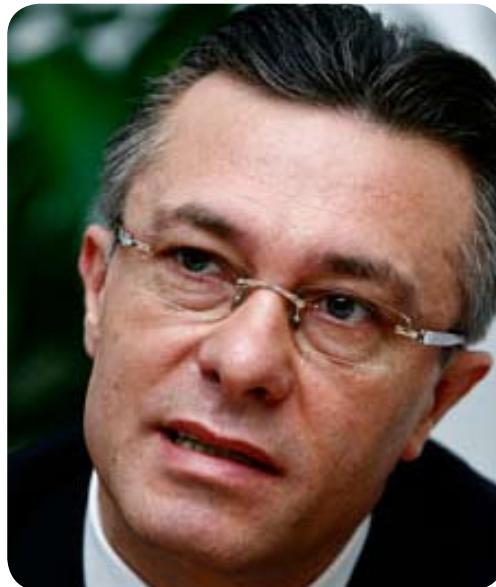
Mr. Cristian Diaconescu, is the Romanian Minister of Foreign Affairs.

The CEI Newsletter has posed him some questions regarding this year's Romanian CEI Presidency: